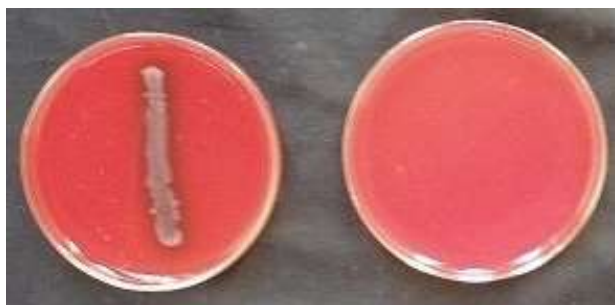
Fig-1: Blood hemolysis