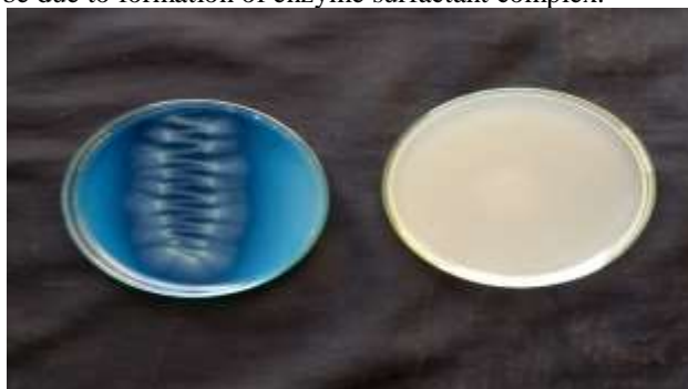
Fig-2: Lipase assay

Zone of clearance was observed around the colonies of Pseudomonas aeruginosa indicating the lipase test positive. (Fig:2). Ni'matuzah et al. , (2012) in his study has screened the Bacillus subtilis for biosurfactant activity and production as in present investigation. Lipase enzyme can catalyse lipid hydrolysis reaction on interfacial oil and water. The hydrolysis of lipid might be due to formation of enzyme surfactant complex.